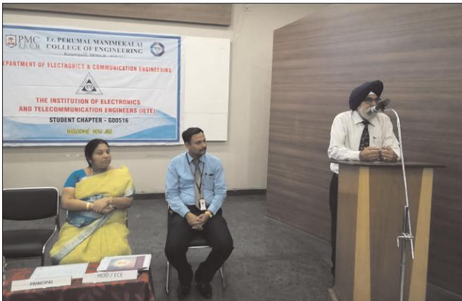
Inauguration of IETE Student Chapter