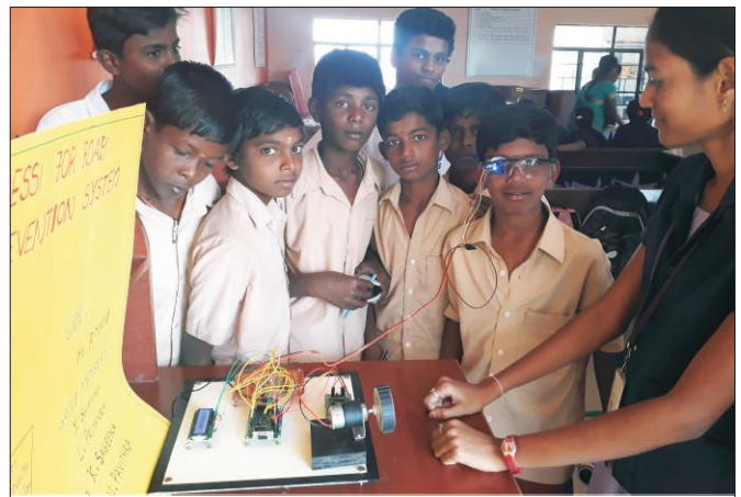
Project Demonstration at TECH EXPO'18