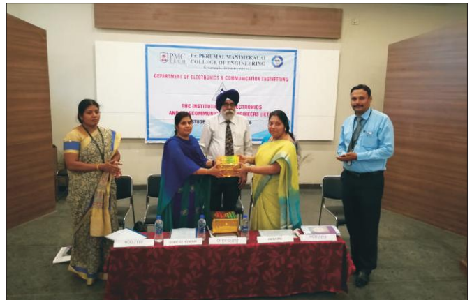
Honoring the Chief Guest-IETE Student chapter