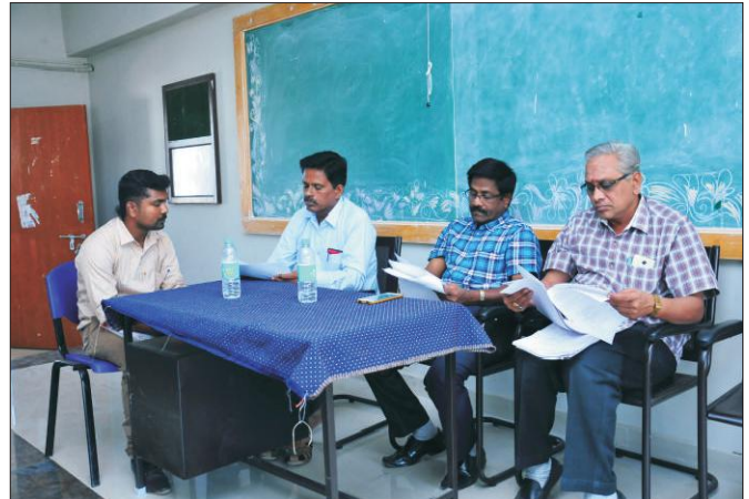
Interview conducted during JOBFAIR