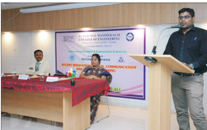
Chief Guest Address in National Conference RIVCS – 17