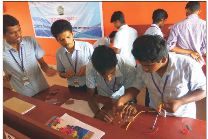
Hands on Training on PCB Design Fabrication