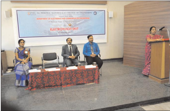
Principal Address in ELECTROVISION – 2K17