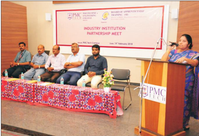
Inaugural of Industry Institution Partnership Meet