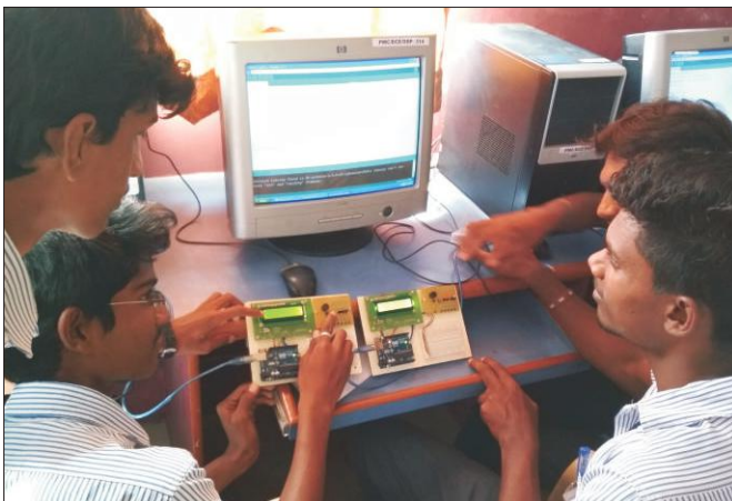
Hands on training on Internet of Things (IOT)