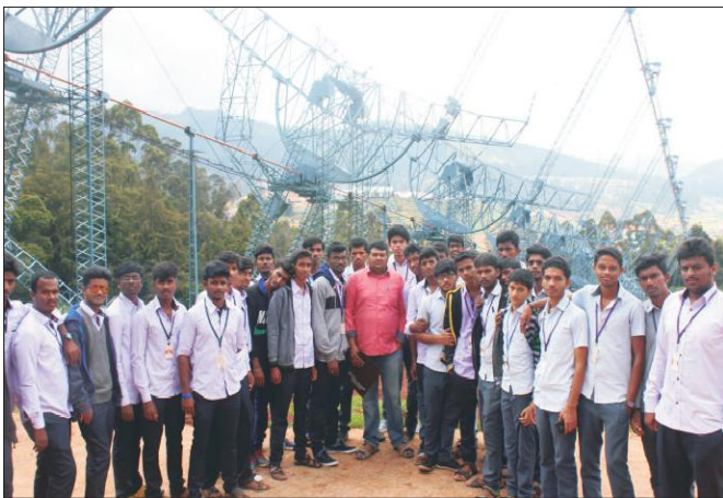
Industrial Visit at Radio Astronomy, Ooty