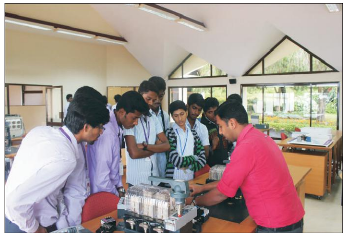
Industrial Visit at L & T Switch Gear Training Centre