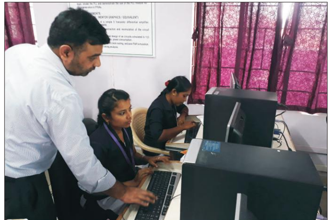
Value Added Course on Embedded with ARM