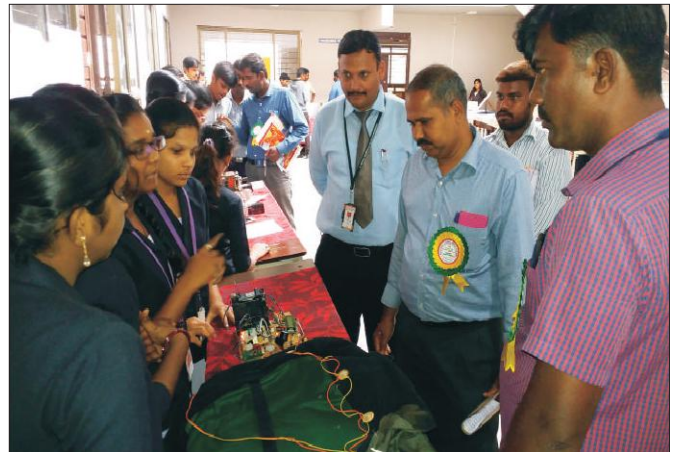
Students in their Demo-National Project summit