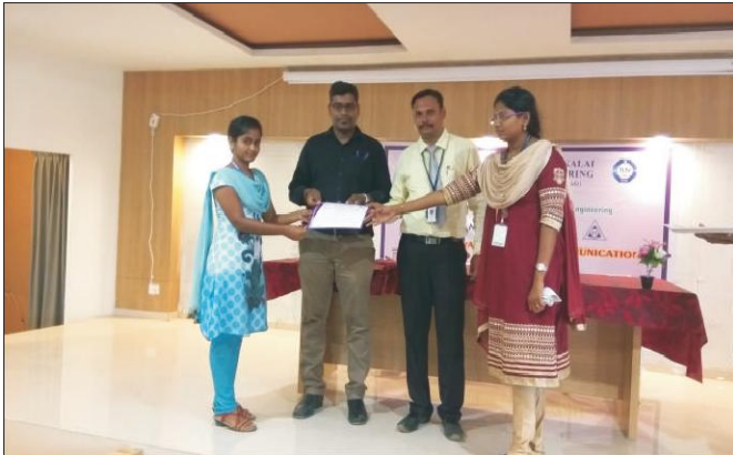
Prize Distribution of RIVCS – 17