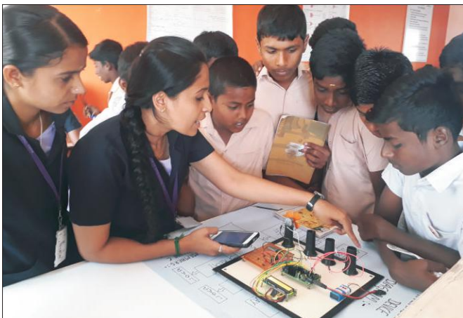
Project Demonstration at TECH EXPO'18