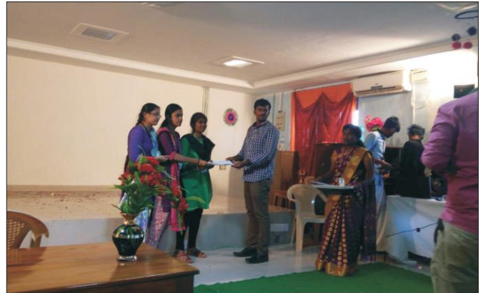
Our Students Won I Prize in GCEB Symposium