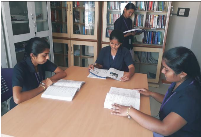
Students utilizing the Department Library