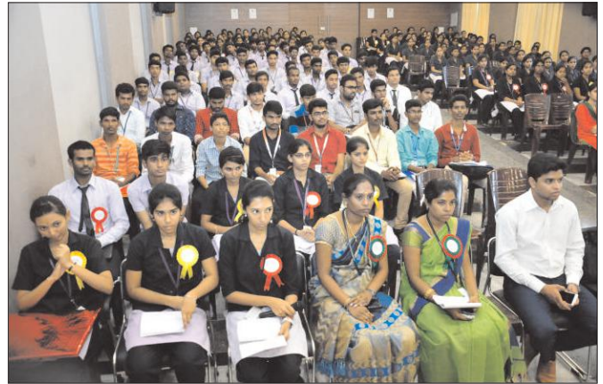
Participants of ELECTROVISION – 2K17