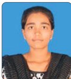
MALA.V GPA - 9.43