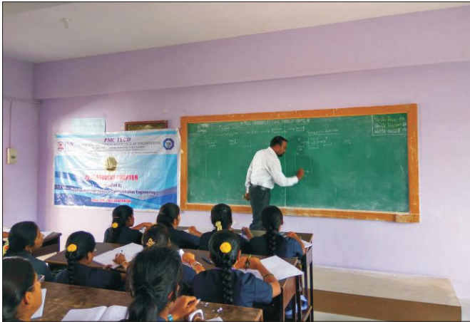
Guest Lecture on Digital Communication