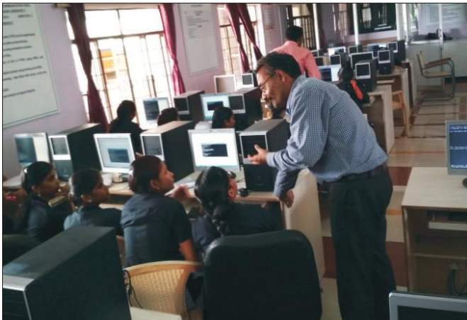
Workshop on PYTHON Programming