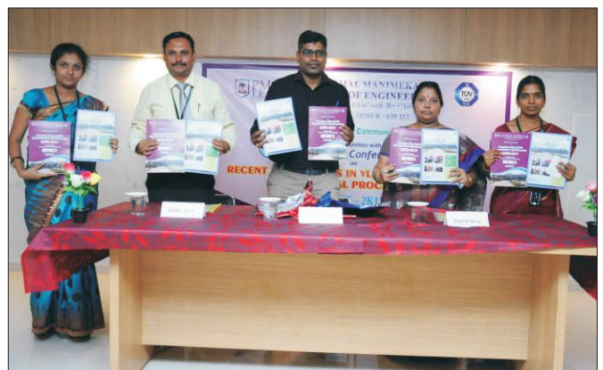
Release of Souvenir & News Letter -17