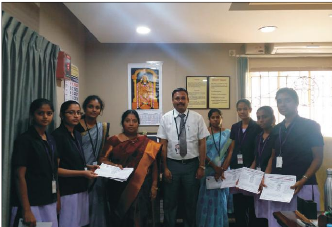
Students being appreciated by principal for the achievement