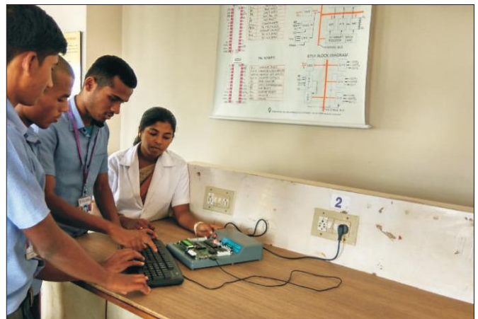
Students doing the experiment in Microprocessor LAB